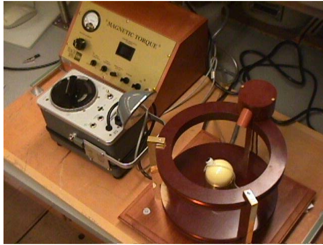
Figure 2: Experimental Setup with Secondary Strobe Light

f_{st} , the white dot will appear to go out of and then back into coherence with the strobe as ball spin slows down.