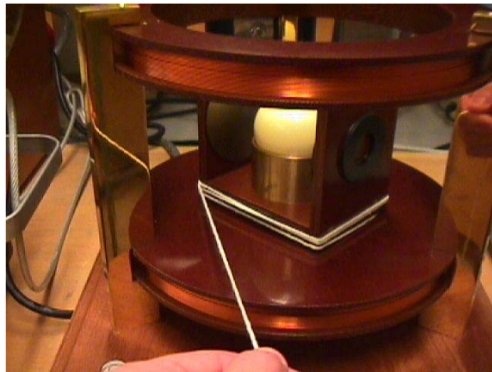
Figure 4: The String-Pull Method and the rotating, transverse-field, device.

A variation of the String-Pull method can also be used to facilitate the rotation of the transverse magnetic field accessory, as shown in Figure 4.